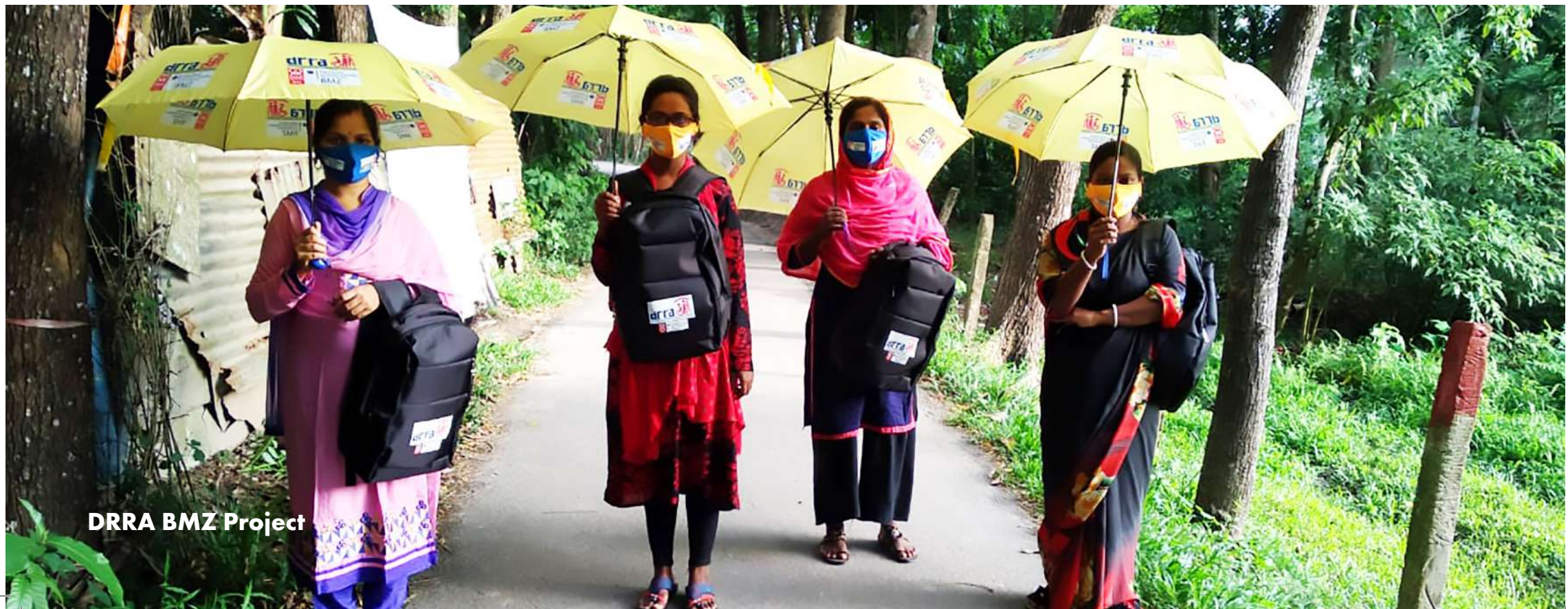
DRRA BMZ Project